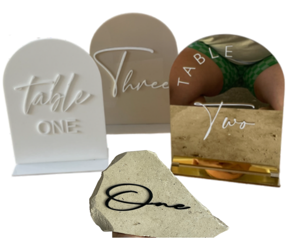
Table Numbers White - Number One to Ten Gold - Numbers One to Five Blush/White - Numbers One to Nine Stone - Numbers One to Five