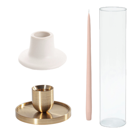
Taper Candles with White or Gold Holders $350 for 30 $490 for 30 with Glass Sleeves