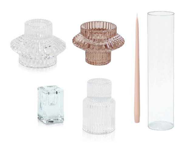
Taper Candles with Glass Holders Clear & Blush available $290 for 30 $490 for 30 with Glass Sleeves