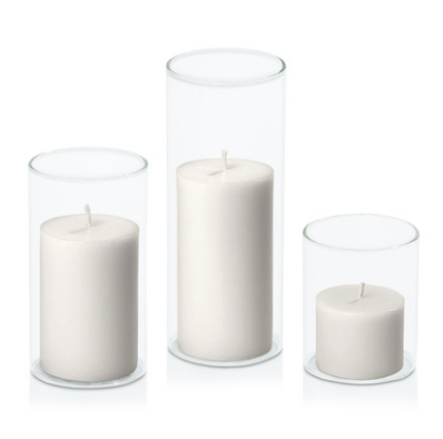
Pillar Candles with Glass Sleeves $490 for 30