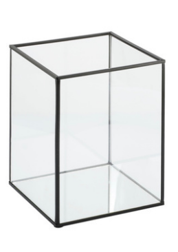
Pillar Candles with Black Cubes $490 for 30