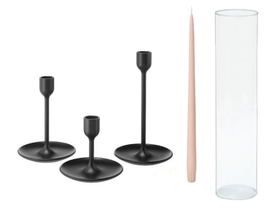
Taper Candles with Gold Holders $350 for 30 $490 for 30 with Glass Sleeves