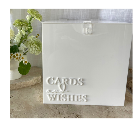
Wishing Well Hire - Cards & Well Wishes White Acrylic $40 each