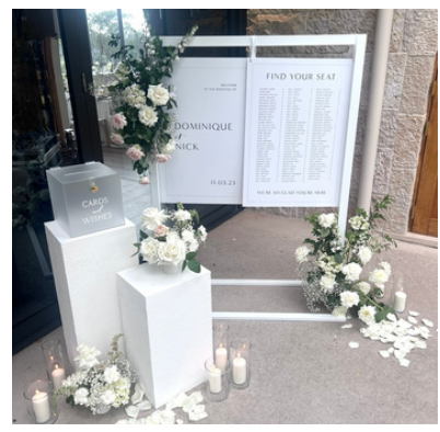
Duo Signage Frame $60