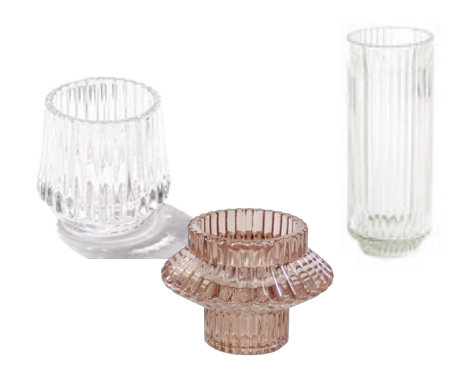
Mixed Luxe Tealights - Clear and Blush available $150 for 30