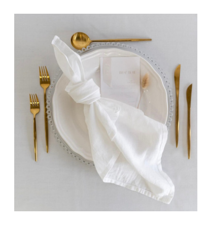
Napkins - Various colours available from $4.40 each